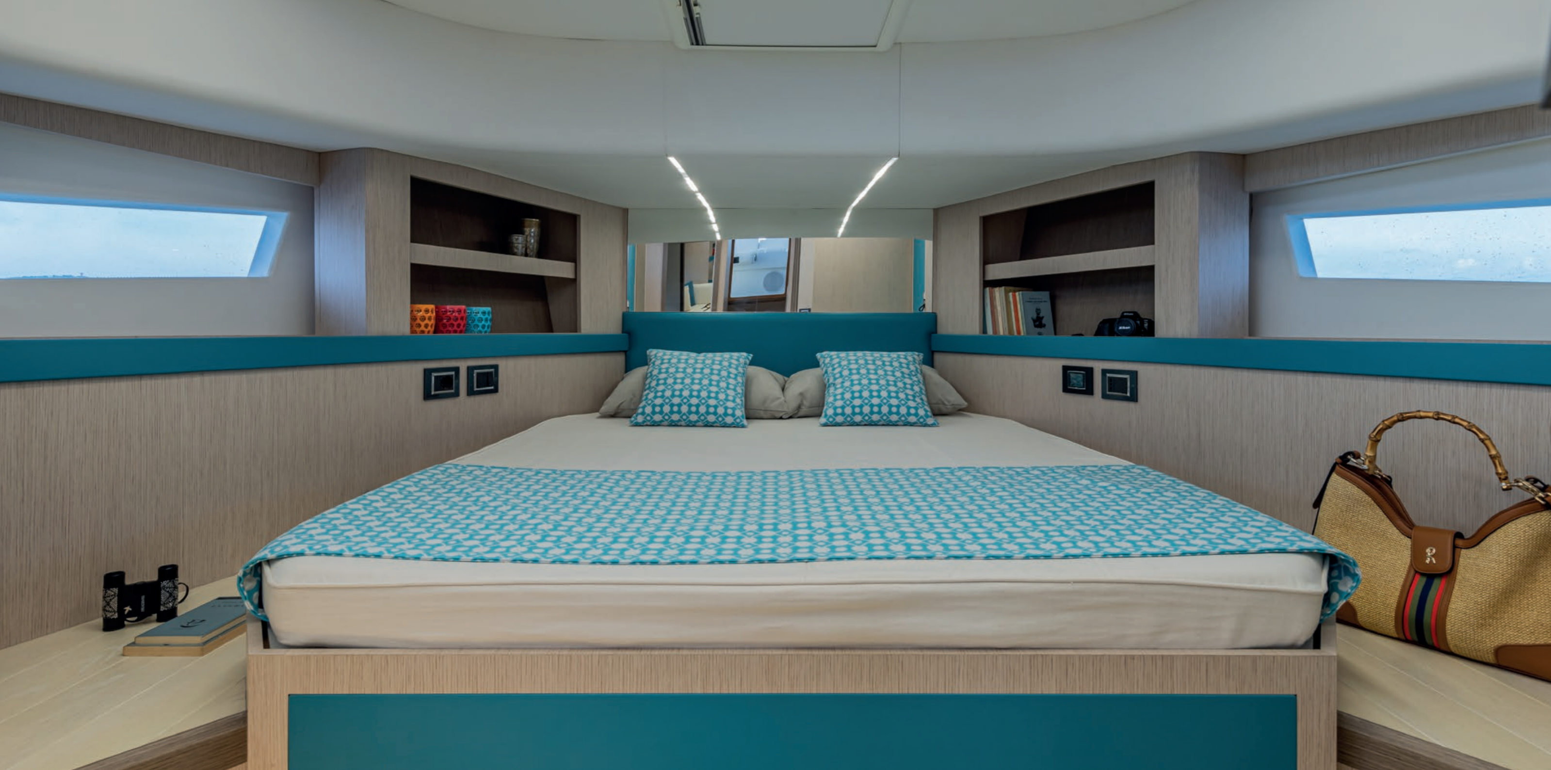
GOZZO 45 Interior with a view