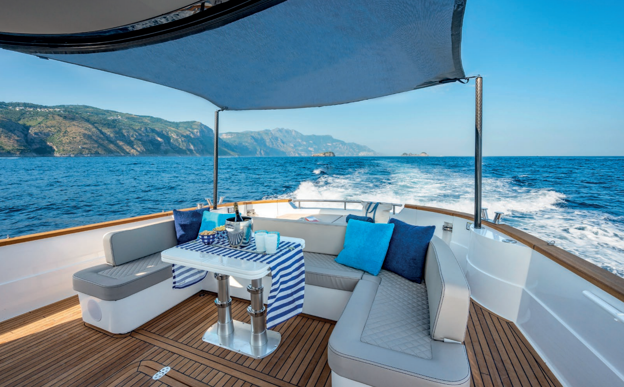
1822 APREAMARE GOZZO 45 GOZZO 45 1826 APREAMARE